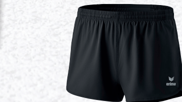
Men's/kids: 109611 black