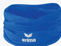
3242004 new royal