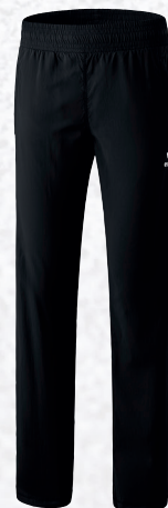
Ladies: 8100701 black