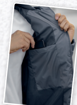
INNER POCKET WITH VELCRO FASTENING