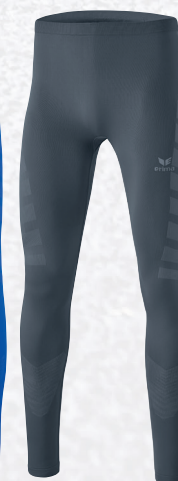
2292301 slate grey