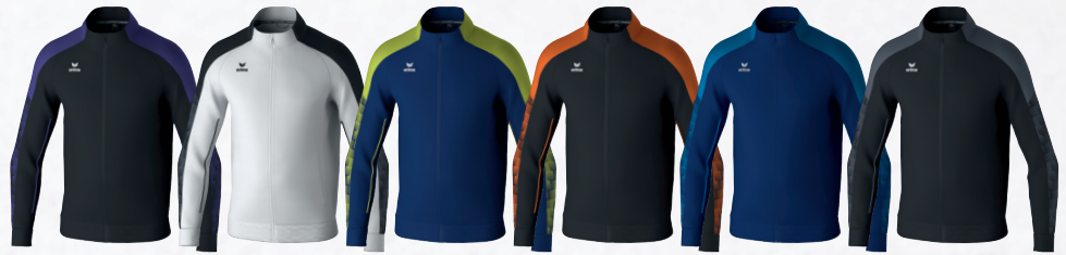
1032418 black/ultra violet