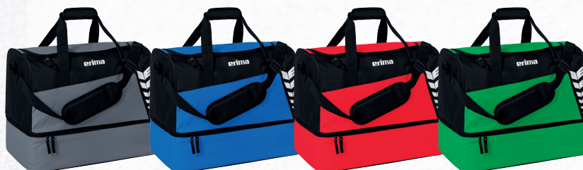
7232309 slate grey/black