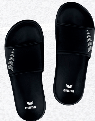
7512301 black grey/slate grey/white