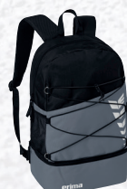
7232317 slate grey/black