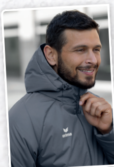
WATERPROOF OUTER MATERIAL