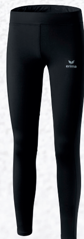
Ladies: 8290706 black