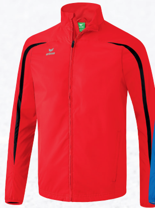
Men's/kids: Ladies: 8060704 8060701 red/black