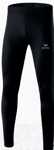
Men's/kids: 8290701 black