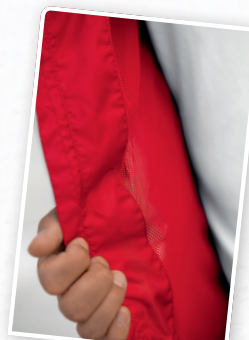
OPENING IN INNER LINING FOR SUPERB FINISH