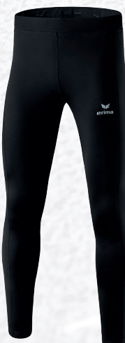
Men's/kids: 8290704 black