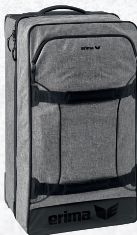
Gr. M 7231801 grey marl