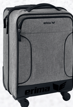
Gr. S 7231801 grey marl

7231801 Size S EUR 179,99* 7231801 Size M EUR 199,99* 7231801 Size L EUR 219,99*