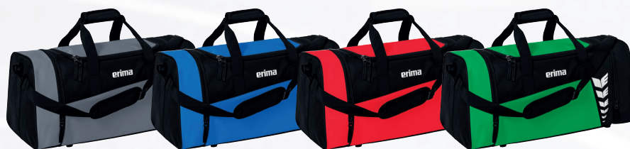
7232301 slate grey/black