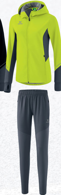
8102304 slate grey