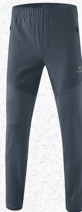
8102302 slate grey