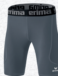
3292301 slate grey