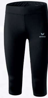
Ladies: 8290707 black