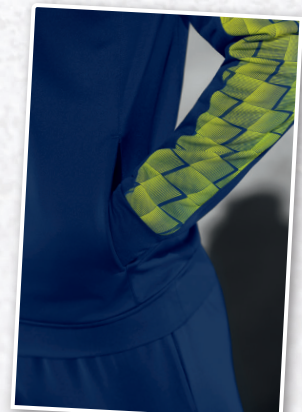
1102302 1102304 new navy/white