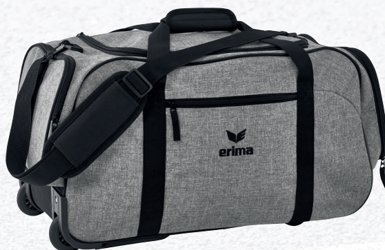
7231901 grey marl/black

7231901 Size S EUR 54,99* 7231901 Size M EUR 79,99*