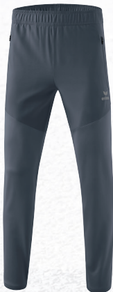
8102302 slate grey