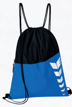
7232326 new royal/black