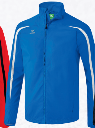
8060705 8060702 new royal/white