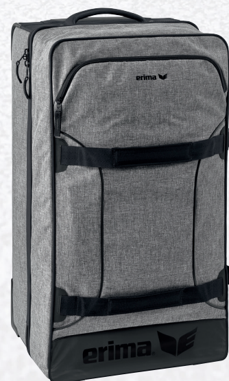
Gr. L 7231801 grey marl