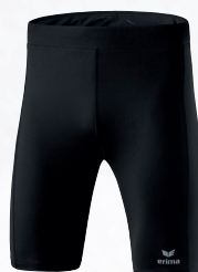
Men's/kids: 8290703 black