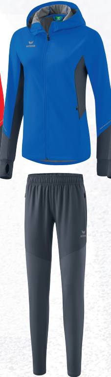
8102304 slate grey