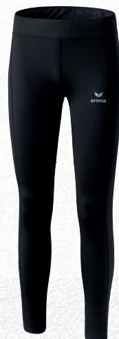
Ladies: 8290705 black