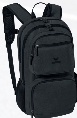
7232335 grey marl/black