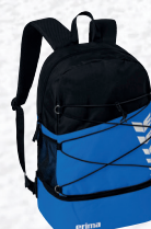
7232318 new royal/black