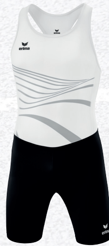
8292321 new white