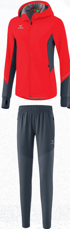
8102304 slate grey