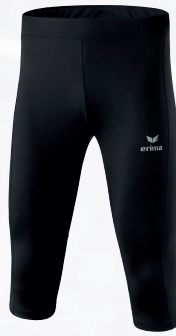
Men's/kids: 8290702 black