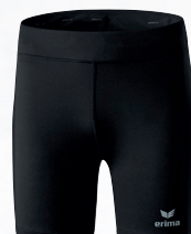
Ladies: 8290708 black