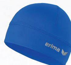
8122002 new royal