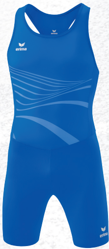
8292318 new royal