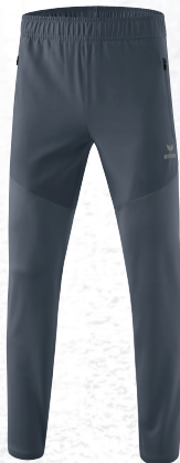
8102302 slate grey