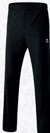
Men's/kids: 8100702 black