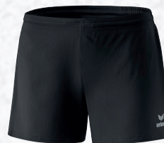
Ladies: 809821 black