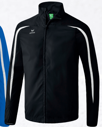
8060706 8060703 black/white