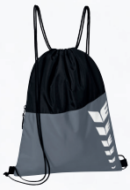
7232325 slate grey/black